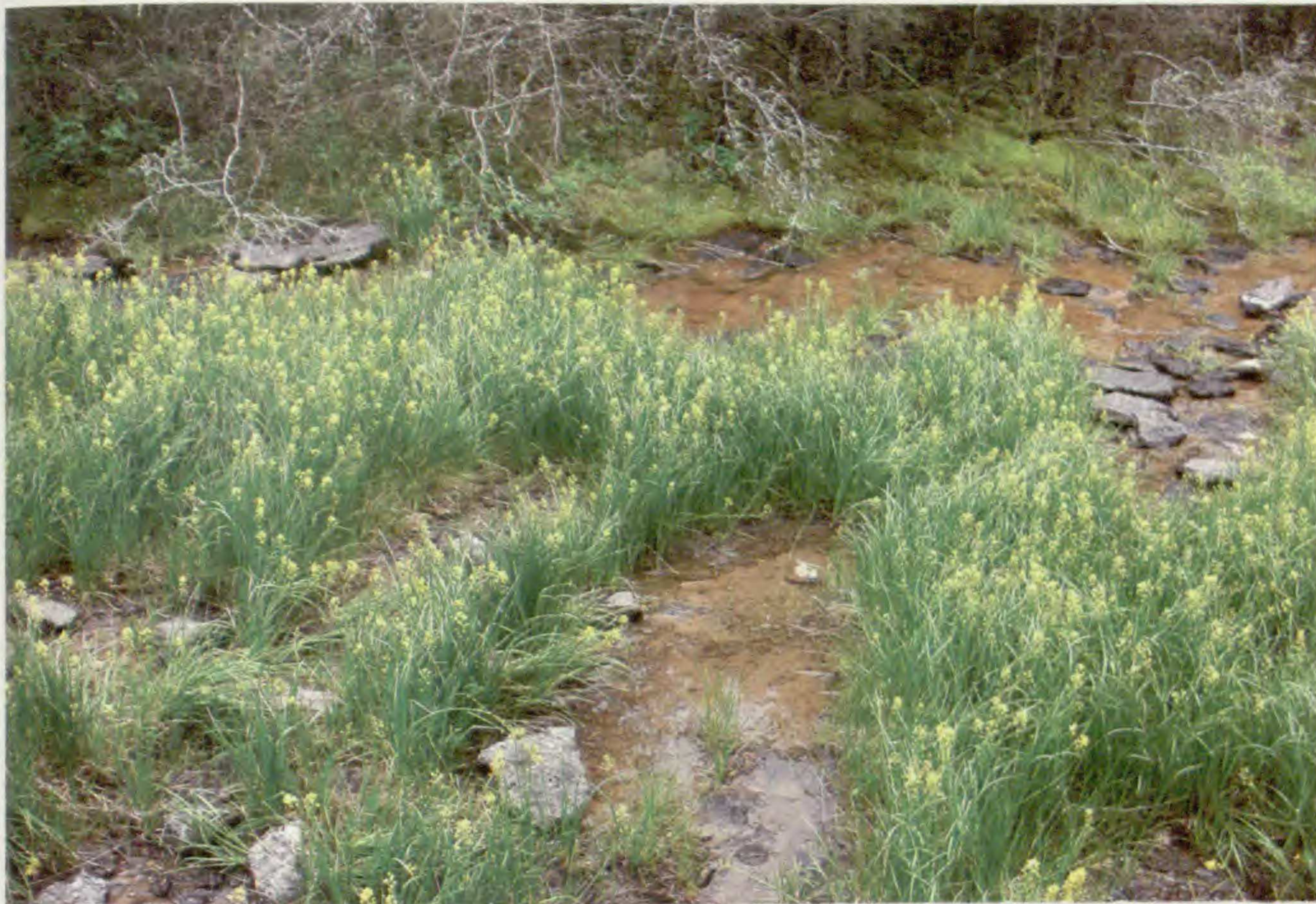
FIG. 2. Top – Site 5, Cedars of Lebanon State Natural Area glade S46, in May 2009. Limestone glade seep community dominated by Schoenolirion croceum and Eleocharis bifida showing the presence of standing water over the near-surface limestone bedrock. Bottom – Site 4, Couchville Cedar Glade State Natural Area, in March 2009. The presence of standing water and use by aquatic fauna, serves as two signs of hydrology which may satisfy the hydrology indicator necessary for wetland determination.